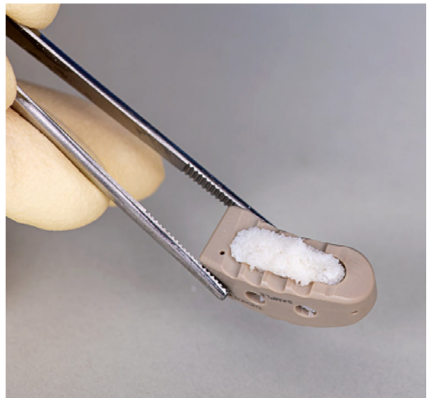
PearlMatrix™ Bone Graft in an Interbody Fusion Device